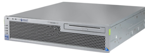
OKEFORD 5500 Media Platform

AIN - SR-3511 and GR-1129 for providing call screening, privacy and self-service applications.