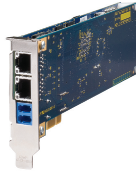
MPAC 3250 STM-1/OC-3 configuration