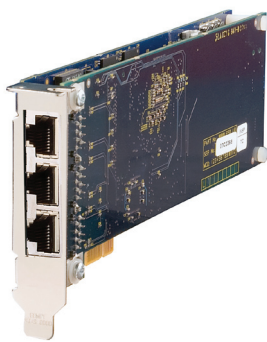
MPAC 3220 4 E1/T1 configuration