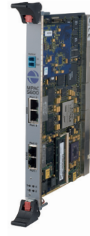
MPAC 5600 cPCI Configuration